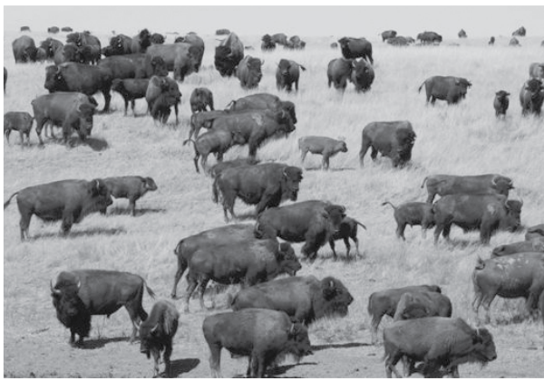
Just part of the Buffalo heard that roams the Ted Turner Ranch, that members of SDWF got to observe during their tour of the ranch on Saturday afternoon during the convention.